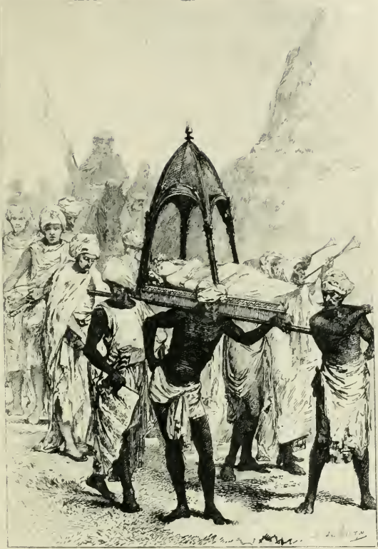
A. Calange Pino et Co.